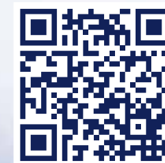
Passau Christmas Market website

Mon-Thu: 10.00am - 8.00pm Fri-Sat: 10.00am - 9.00pm Sun: 11.30am - 8.00pm